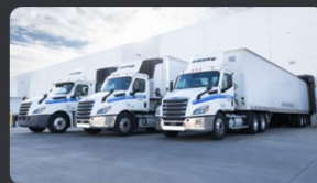
TRANSPORTATION AND LOGISTICS