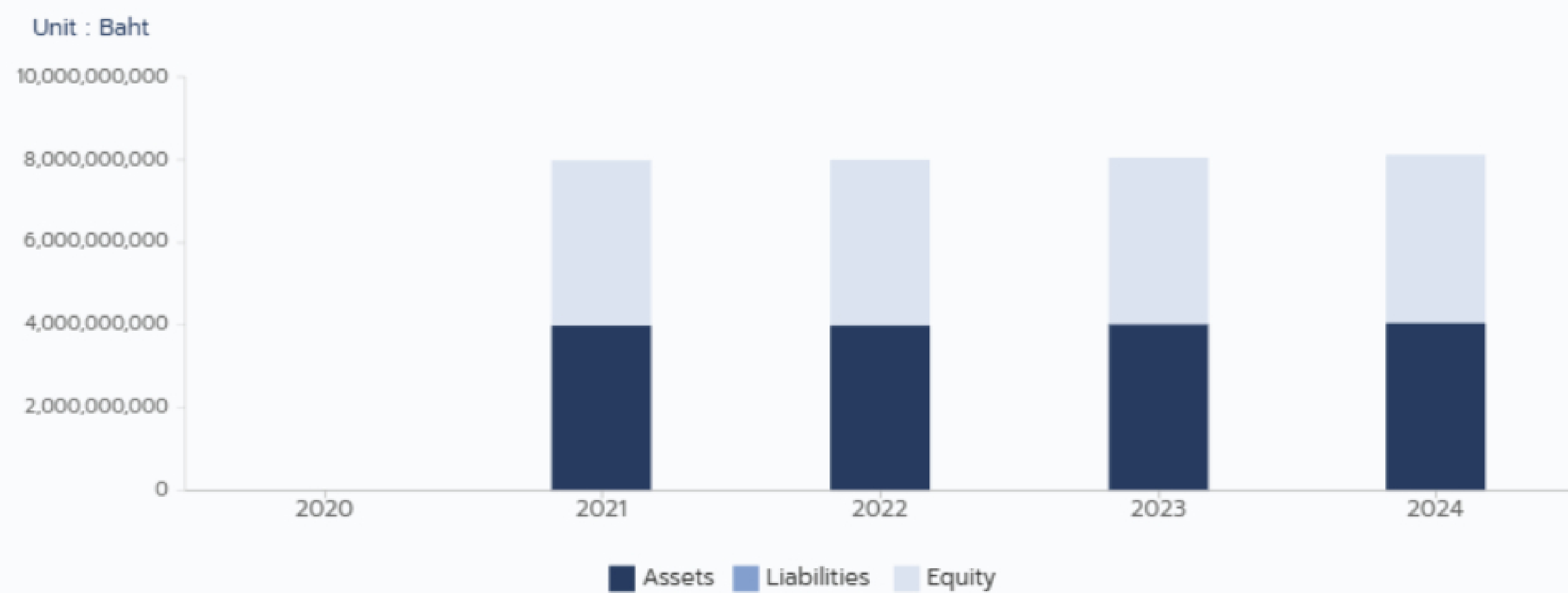
Balance Sheet Proportion