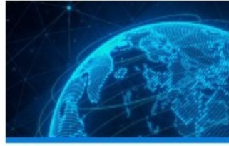
Q2 Impact goes to court over its OASIS+ bid rejection