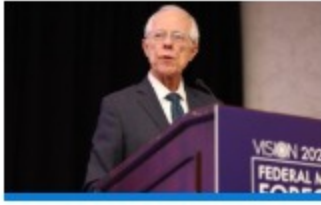
WT 360: Unpacking what we can from the Trump 2.0 transition so far