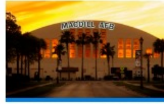
Air Force starts the bidding for $750M CENTCOM support contract