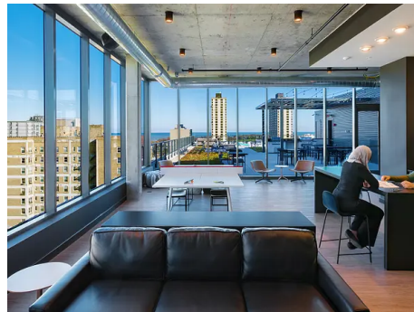
Residential & Hospitality