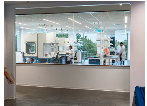
Science & Technology