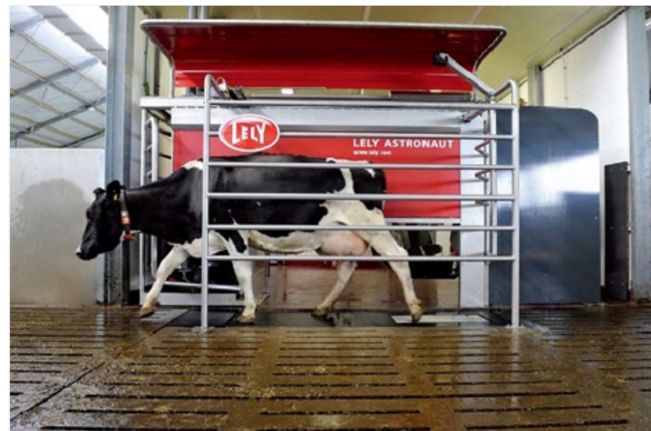
2. Milking Robot (Made from Lely)