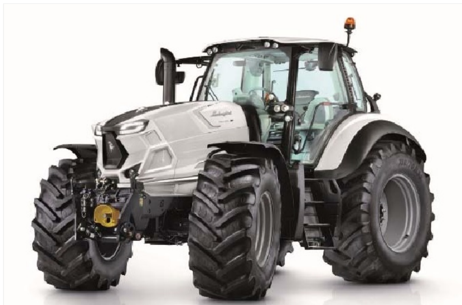
1. Tractor (Made from Lamborghini)