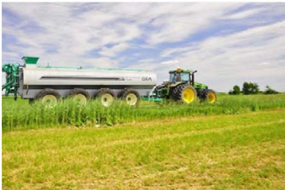
5. Silage Treatment Machine (Made from GEA Houle)