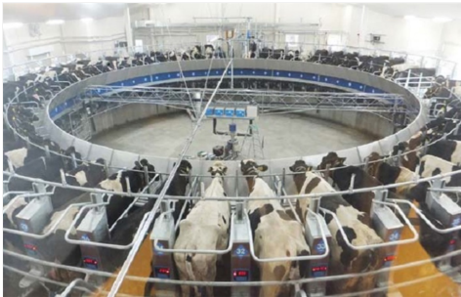
3. Milking Parlour (Made from Milkline)