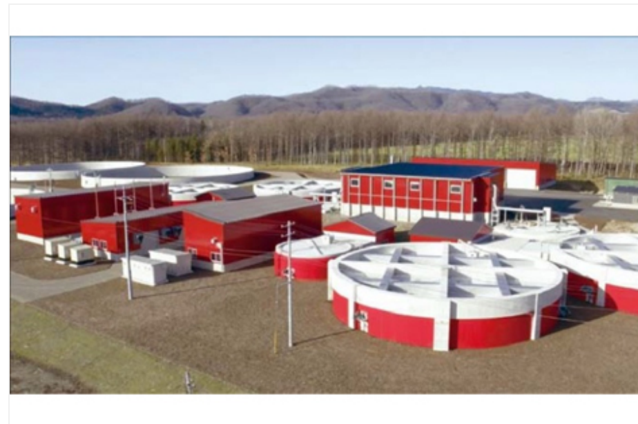
6. Biogas Plant (Shikaoi-cho, Hokkaido)