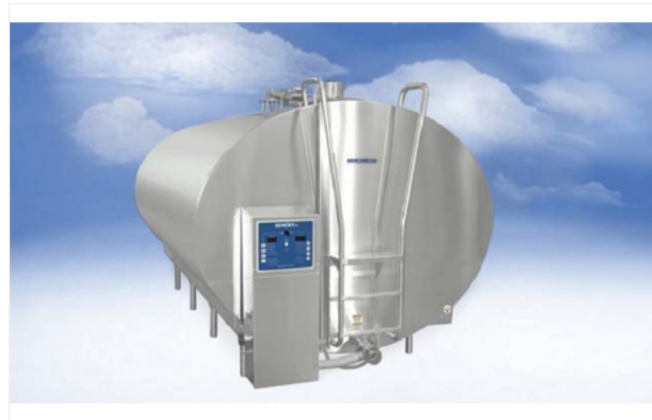
4. Milk Cooling Tank (Made from Mueller)