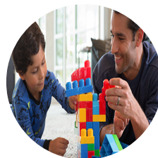
Covering life's situations

(/lc/resources/home/articles/what-is-personal-liability-insurance)