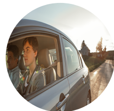
Adding a teen driver

(/lc/resources/home/articles/what-and-retirement/articles/life-insurance-situations)