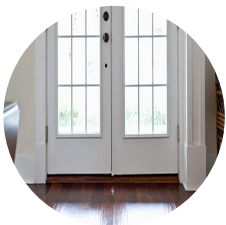
Buying a home

(/lc/resources/home/articles/what-to-know-before-buying-a-house)